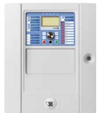
7 zone manual evacuation

ZP2 series is supported by a full line of associated equipment, all working in harmony providing years of trouble-free operation with proven technology and easy maintenance features.